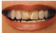
STAINED & CHIPPED—BEFORE

SMILE IMPROVEMENTS TOOK PLACE WITHOUT REMOVING SENSITIVE TOOTH STRUCTURE!