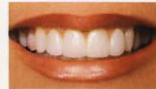
AFTER WITH LUMINEERS